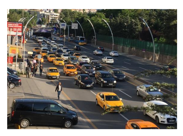
Figure 2. Kuğulu grade separated junction blocking pedestrian crossing at the city center

Highway construction policies and projects adversely affected majority of the citizens including public transport users, pedestrians, elderly, children and all non-car-owning citizens. Grade separated junctions canceled at-grade pedestrian crossings. Pedestrian overpasses were constructed at roads that became high-speed due to grade-separated junctions and even in the city centre. Overpasses increased walking distance of pedestrians. Pedestrians with accessibility problems faced with limitations in using overpasses and crossing main arterials safely (Figure 2 and Figure 3).